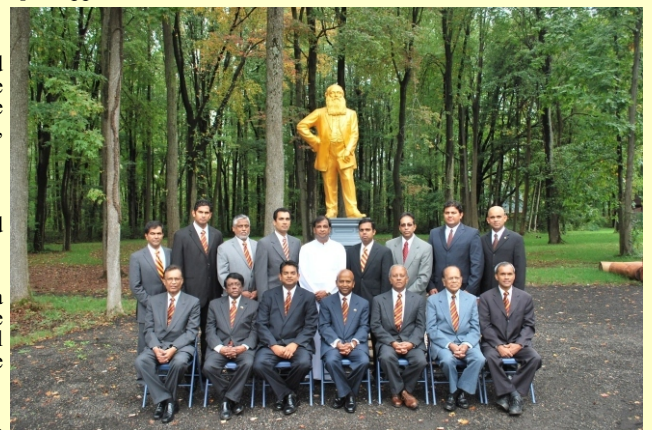
A statue of Col. Olcott was Unveiled in USA to coincide with Ananda 125 Anniversary Celebrations