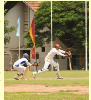
An Ananda Batsman playing a defensive stroke watched by the Wicket keeper of Jaffna Hindu College